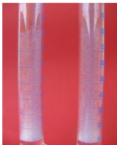
Shampoo + 2% Olivatis 15C Shampoo